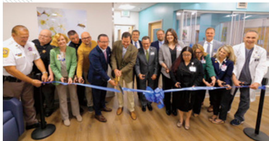
The Valley Health Emergency, Psychiatric Assessment, Treatment, and Healing (EmPATH) unit opened in October with an official ribbon-cutting ceremony.